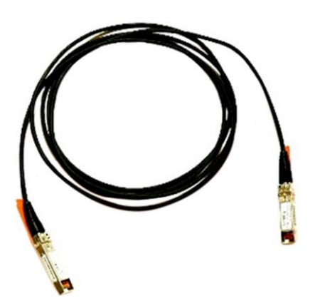
Figure 3. Cisco Direct-Attach Twinax Copper Cable Assembly with SFP+ Connectors