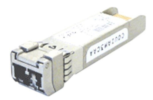
Figure 1. Cisco 10GBASE SFP+ Modules

The Cisco<sup>®</sup> 10GBASE SFP+ modules (Figure 1) give you a wide variety of 10 Gigabit Ethernet connectivity options for data center, enterprise wiring closet, and service provider transport applications.