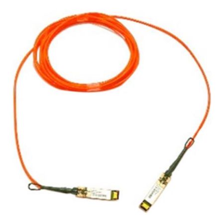
Figure 4. Cisco Direct-Attach Active Optical Cables with SFP+ Connectors

Cisco SFP+ Active Optical Cables (Figure 4) are direct-attach fiber assemblies with SFP+ connectors. They are suitable for very short distances and offer a cost-effective way to connect within racks and across adjacent racks. Cisco offers Active Optical Cables in lengths of 1, 2, 3, 5, 7, and 10 meters.